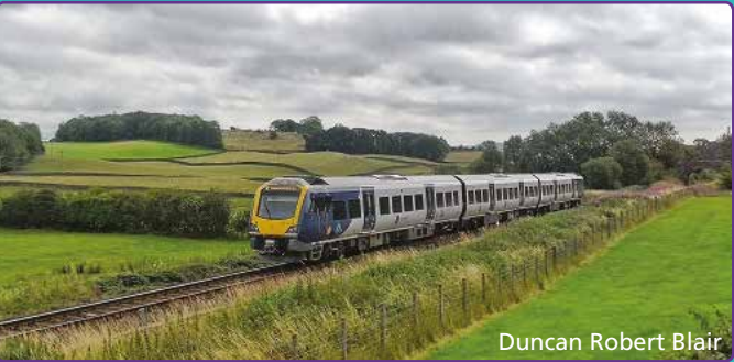
Duncan Robert Blair

This ten mile jewel of a railway connects busy Oxenholme station on the West Coast Main Line with Windermere, the gateway to the Lake District, serving en route the town of Kendal and the villages of Burneside and Staveley. At Windermere you'll find onward bus connections to many parts of this World Heritage Site and National Park. From Windermere Station, it's only a short bus ride down to Bowness-on-Windermere, where you can take a cruise with unforgettable views of Lakeland's magnificent fells from England's largest lake.